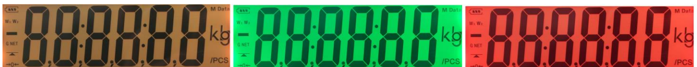
Adjustable Tri-Color Check Result Backlight

19sa always deliver more than it is expected and the #1 choice whenever & wherever performance, reliability, durability and flexibility are of no compromise.